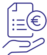
Financial and administrative support