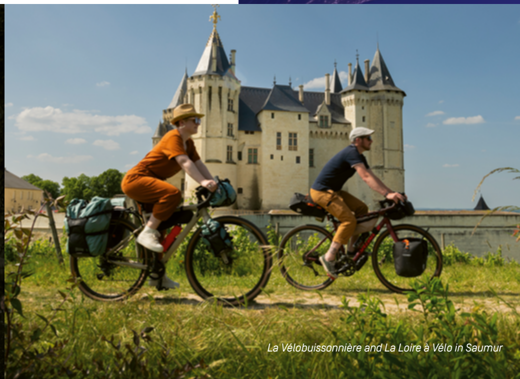
La Vélobuissonnière and La Loire à Vélo in Saumur