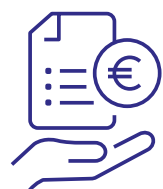
Financial and administrative support