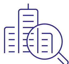
Search for land or buildings