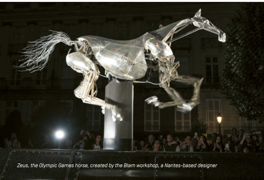
Zeus, the Olympic Games horse, created by the Blam workshop, a Nantes-based designer