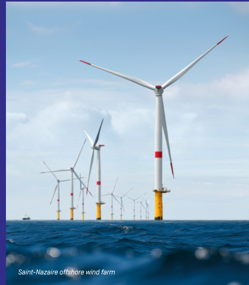
Saint-Nazaire offshore wind farm

Naval Group Thalès Manitou Les Chantiers de l'Atlantique Lactalis